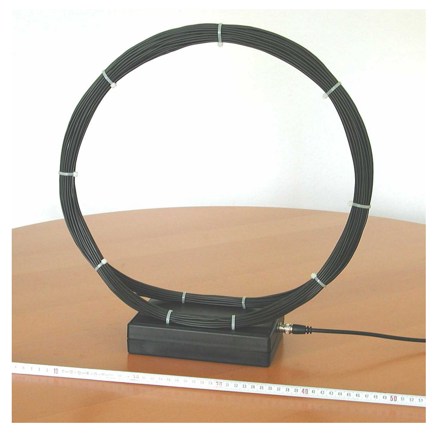
Figure 1. The prototype loop has 40 turns and a diameter of about 38 cm.

insufficient for frequencies above 70 kHz, compared to my other active antennas, a Rhode & Steward HE-011, and a Wellbrook ALA1530 loop. For this reason, a slightly different design was chosen: Instead of using a "zero input impedance" amplifier, the loop is terminated by a load of a few kohms (the observed gain lack was not caused by the amplifier; the circuit used in the first tests had a flat frequency response up to well beyond 500 kHz).