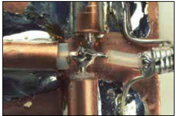
A close up of the T-junction connected to 50-Ω Teflon coax.

A significant disadvantage of transmission line filters is